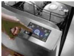
KENMORE ELITE® DISHWASHER WITH INTERACTIVE COLOR LCD CONTROLS

Google TV delivers a new experience by bringing the TV and internet together. Using your existing cable or satellite service and at no additional cost, Google TV gives you access to more entertainment options and simplifies the process of finding what you're looking for. Plus, you can enjoy both TV and web content at the same time, on the same screen.