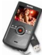
KODAK Zi8 POCKET VIDEO CAMERA

It's small enough to fit in your pocket, but why would you ever want to put it there? Whether out on the town or just hanging with friends, the KODAK Zi8 Pocket Video Camera captures every experience in stunning 1080p HD video.