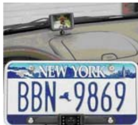
AUDIOVOX MULTIVIEW CAM WITH PEDESTRIAN WARNING

We can put a man on the moon, but we've yet to build a car without blind spots. Audiovox's MultiView Cam with Pedestrian Warning goes several steps further than your average car rear-view camera system, offering a 180-degree lens and low-light capabilities that help you see what's coming from side angles when you're backing up. The system even gives audio alerts to let you know if a car, bike, or pedestrian is approaching from the rear sides of your car.