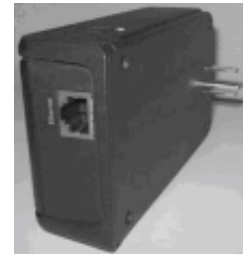
HOMEPLUG AV WITH CLEARPATH

With the Jabra STONE2 you have new opportunities. You can take talk much further.