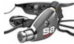
SLEEK AUDIO'S SA7 EARPHONES

The SA7, by Sleek Audio, sets a new standard for mobile audio performance through advanced design technology. A milled aluminum core houses a first-of-its kind custom tuned dual armature driver configuration. The drivers are encased in a layer of silicone, further protected by military-grade carbon fiber sidings and held together with a titanium hexagonal fastener. Yet the groundbreaking construction of this earphone is just one aspect of the technology it employs. The drivers are tuned by Sleek's acoustic engineers to offer striking clarity with brilliant highs, strong mids and accurate, powerful bass. To enhance the audio experience even further, the SA7 boasts Sleek's acclaimed VQ™ Tuning system, allowing you to acoustically tune your music to match your individual sonic preference. No detail of music is lost regardless of where you choose to listen with the SA7. ESC (Environmental Sound Control) blocks more than double the ambient noise of larger, "noise cancelling" earphones allowing you to escape into your music. As part of Sleek's Signature series, the SA7 also offers Wireless Hybrid Technology, giving you the ability to go from wired, to wireless and back again using Klear lossless technology.