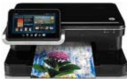
HP PHOTOSMART ESTATION ALL-IN-ONE PRINTER C510