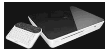
SONY INTERNET TV BLU-RAY DISC PLAYER, POWERED BY GOOGLE TV TELEVISION, MEET INTERNET.

The SA7, by Sleek Audio, sets a new standard for mobile audio performance through advanced design technology. A milled aluminum core houses a first-of-its kind custom tuned dual armature driver configuration. The drivers are encased in a layer of silicone, further protected by military-grade carbon fiber sidings and held together with a titanium hexagonal fastener. Yet the groundbreaking construction of this earphone is just one aspect of the technology it employs. The drivers are tuned by Sleek's acoustic engineers to offer striking clarity with brilliant highs, strong mids and accurate, powerful bass. To enhance the audio experience even further, the SA7 boasts Sleek's acclaimed VQ™ Tuning system, allowing you to acoustically tune your music to match your individual sonic preference. No detail of music is lost regardless of where you choose to listen with the SA7. ESC (Environmental Sound Control) blocks more than double the ambient noise of larger, "noise cancelling" earphones allowing you to escape into your music. As part of Sleek's Signature series, the SA7 also offers Wireless Hybrid Technology, giving you the ability to go from wired, to wireless and back again using Klear lossless technology.